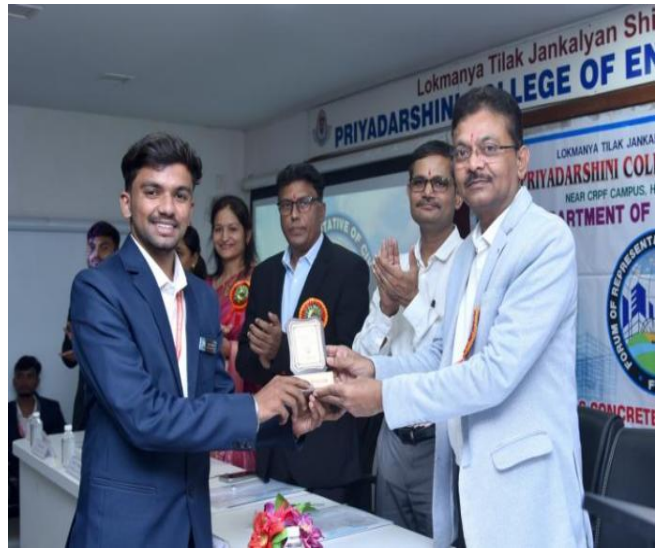
Felicitatation of RTM Nagpur University Exam Topper Students