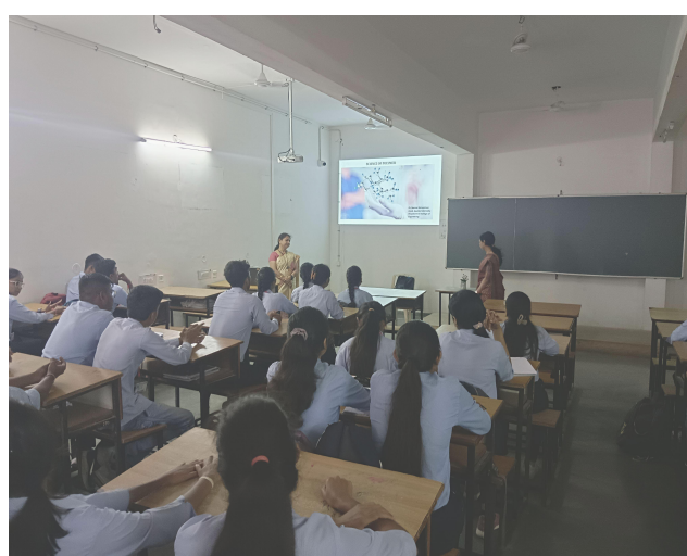
Guest Lecture on “ Polymerization of Construction materials”