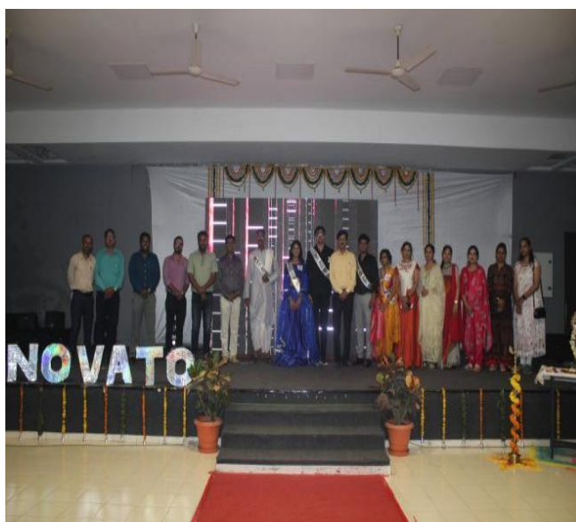
NOVATO - 2024-2025