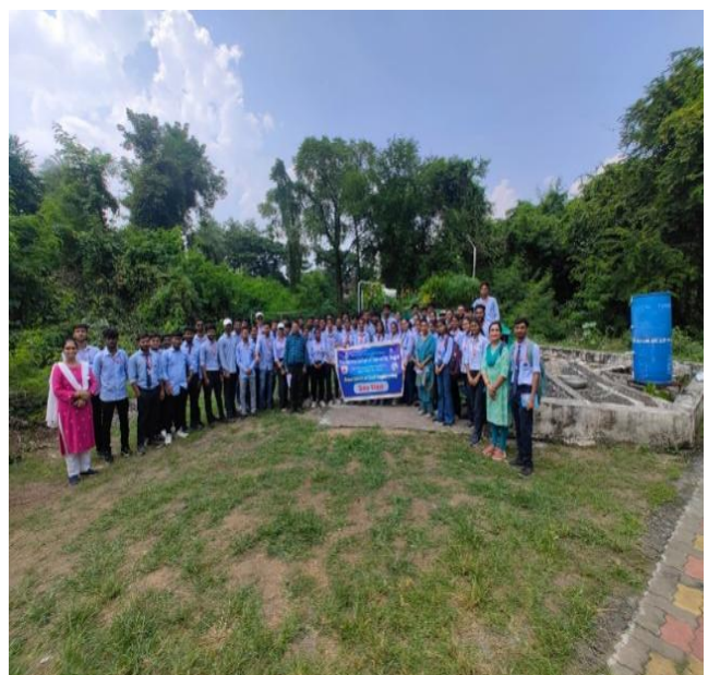
One day site visit at CSIR-NEERI, Nehru Marg, Nagpur.