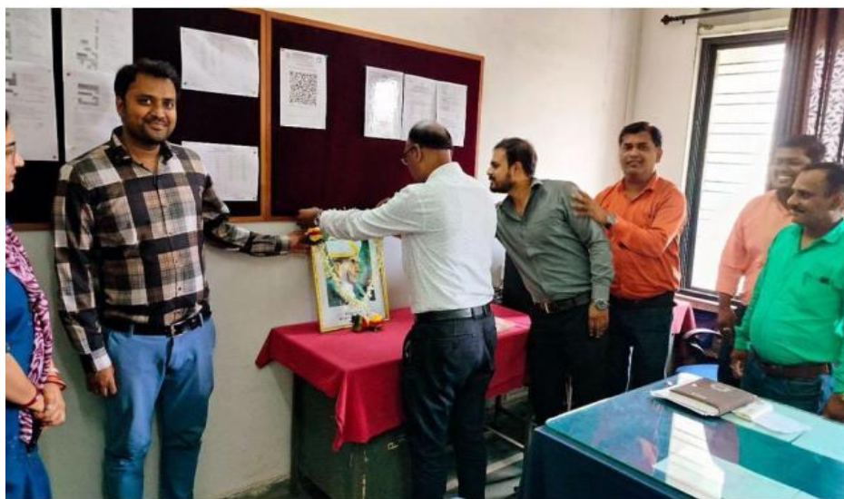
Engineer's day Celebration