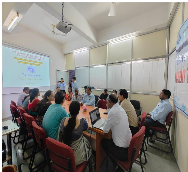
Parents Teacher Meet