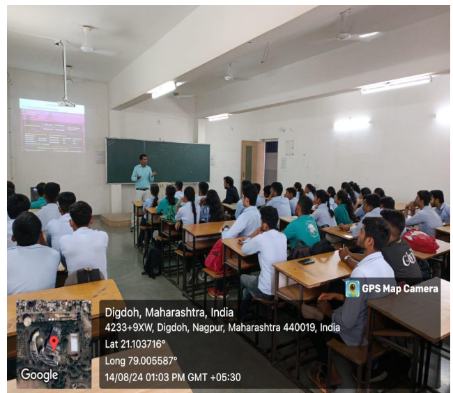
Guest Lecture on “Essential Awareness and Strategies for the GATE Exam Success”