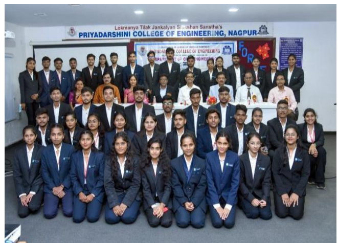
Installation Ceremony of Student Forum “FORCE” 2024-25