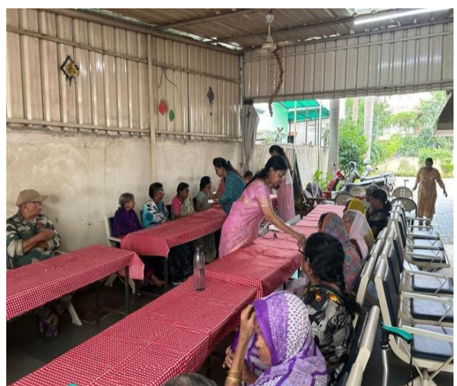
Founder's Day Celebration