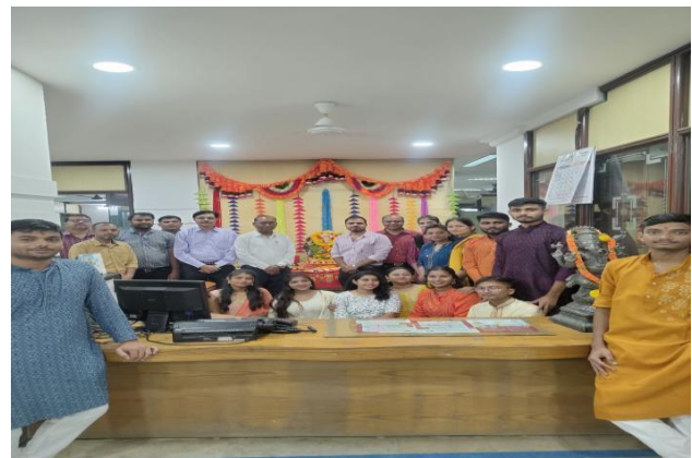
Ganesh Ji aarti at Admin Block (Wing - A)