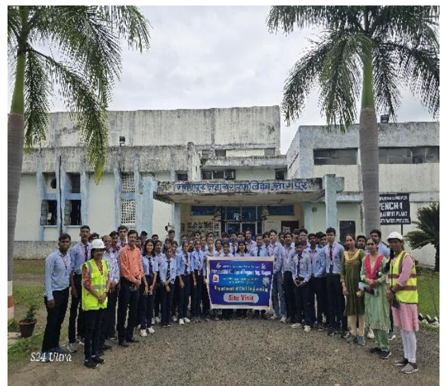
One day site visit at Water Treatment Plant Gorewada Nagpur