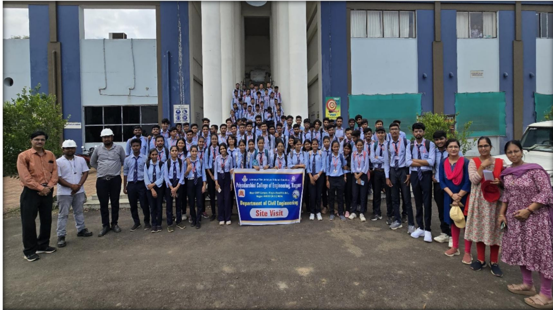
One day site visit at Waste Water Treatment Plant Bhandewadi, Nagpur