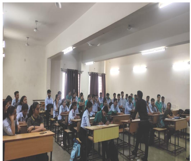
Guest Lecture on “ Skills Required and Opportunities in Civil Engineering”