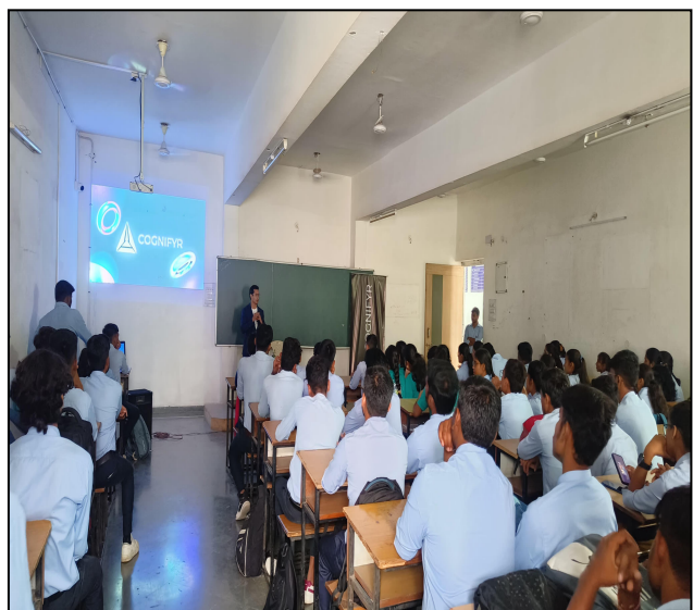
Guest Lecture on “ Introduction to BIM ”