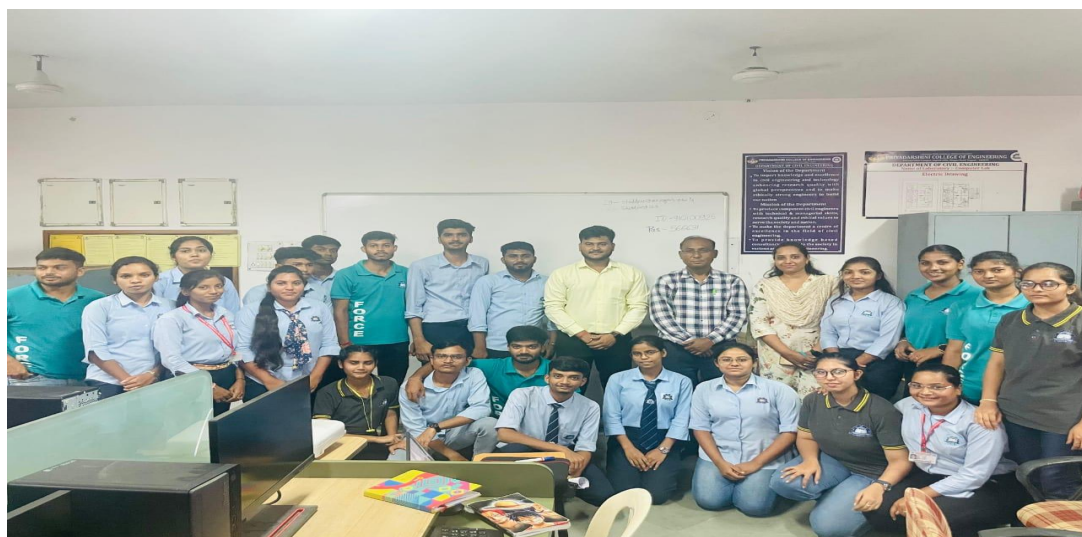
Certificate Course on Revit -PHASE-I