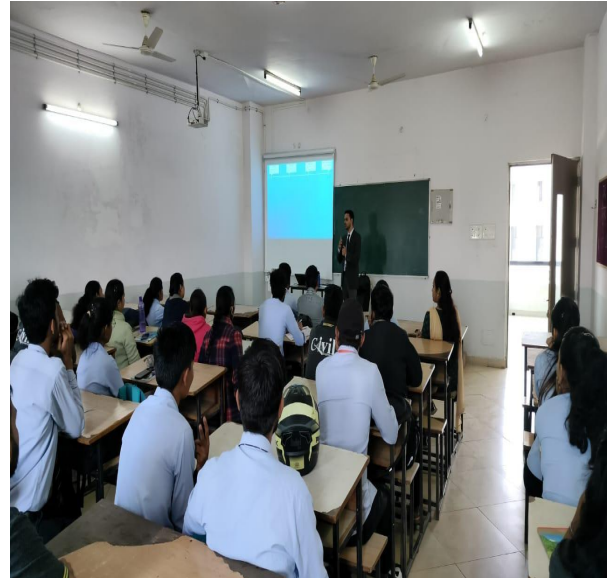
Guest Lecture on “Introduction to various software used in Civil Engineering”