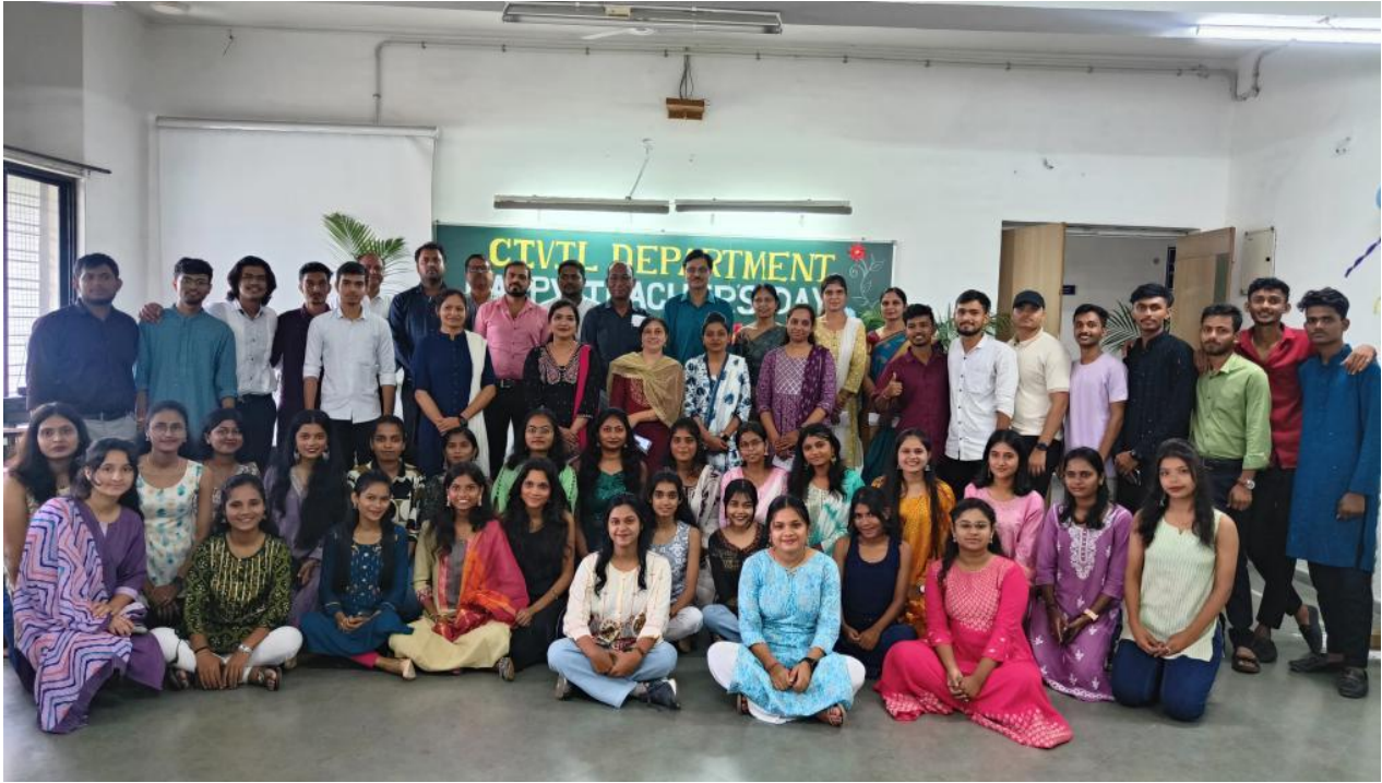
Teachers Day Celebration