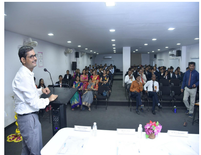
Guest Lecture on “ Role of Civil Engineers in Construction Projects ”